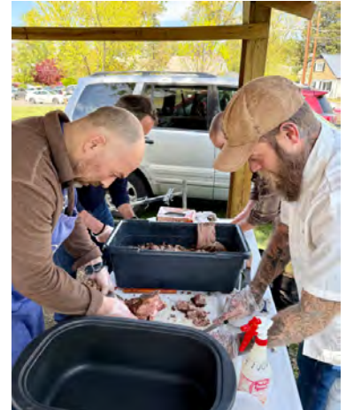
2026 Lambmeisters