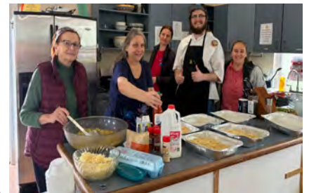
Pictured: Volunteers who cooked for the Volunteer Appreciation Lunch - Gumbo!

This kind of service is a blessing to St. Mary. It reflects love for God, love for neighbor, and a willingness to give of ourselves for the good of the community. We are deeply grateful for every hour, every effort, and every prayer offered in service to the parish. ✠