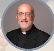
Director of the Center for Family Care of the Greek Orthodox Archdiocese

Sessions on Orthodox Marriage Basics and Improving Marital Communication for couples of all ages, as well as engaged couples preparing for marriage.