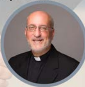
Director of the Center for Family Care of the Greek Orthodox Archdiocese

Sessions on Orthodox Marriage Basics and Improving Marital Communication for couples of all ages, as well as engaged couples preparing for marriage.